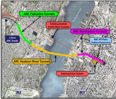
Figure 7. New large bore tunnel for rail into NYC:

Access to the Region's Core-Trans-Hudson Tunnel that will carry intercity rail between New Jersey and Manhattan will measure approximately 50 ft diameter.