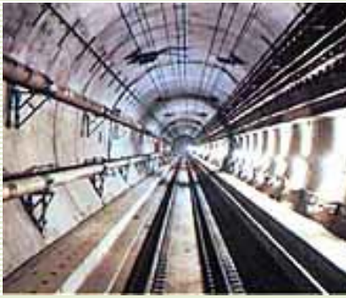
Figure 9. English Channel Tunnel showing concrete segmental lining, utilities and systems strung on sides and single track with walkway

of groundwater. Fault zones and the ground conditions within and approaching the faults often present the greatest challenges to tunneling because of the presence of high water pressures and highly fractured to soft “gouge” materials that can be unstable and require special support and approaches.