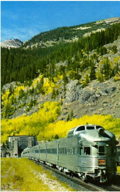
Figure 4. East Portal of the Moffat Tunnel passing under James Peak in the Rocky Mountains (West of Denver, pass at about elevation 9000 ft. )