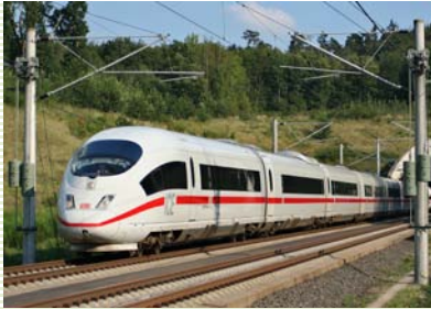
Figure 3. ICE 3 train exiting the Oberhaider-Wald tunnel in Germany

conditions along the entire route prior to the construction of the two larger tunnels to either side. Despite, the additional cost and longer period of construction, this three tunnel configurations provides many useful functions before and during operations. Based on evidence from the Channel Tunnel an analysis of air pressures, pressure relief ducts and the lateral forces imposed on the train is required during the next level of design.