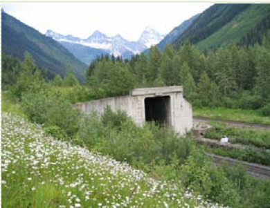
Figure 5. West Portal of the Roger's Pass Mt. MacDonal Rail Tunnel, longest tunnel in North America

Rail alignment alternatives through the Rocky Mountains will require a significant amount of tunneling to maintain operable and safe grades, avoid areas prone to rock falls and avalanches, and to provide the shortest routes. There are a number of historic tunnels through the Rocky Mountains and a few of these are dedicated to freight and passenger rail services. The Moffat Tunnel, completed in 1927, is a single track tunnel that was built to cut off 27 miles to reduce the elevation of the older tunnel. The Moffat Tunnel passes under James Peak, has a cross section of 16 ft wide by 24 ft high. The longest tunnel (14.7 km) in North America is the Mount MacDonal Rail Tunnel at Roger's Pass through the Rocky Mountains in British Columbia, Canada. The Mt. MacDonal Tunnel provided additional capacity and safer, separate, bi-direction traffic. The most recent US tunnels have been built for highway services including the older Eisenhower tunnel, and the environmentally sensitive and aesthetic Glenwood Canyon Tunnels along Route 70. These tunnels are not long when compared to recent rail and highway tunnel in Europe and compared to those planned as part of this feasibility study.