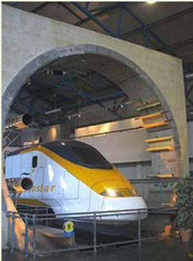
Figure 1 . Eurostar high speed trainset in Eurotunnel mock up