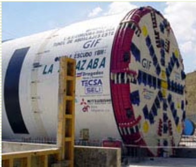
Figure 8. Robbins Tunnel Boring Machine single shield used in unstable ground

Access to the Region's Core-Trans-Hudson Tunnel that will carry intercity rail between New Jersey and Manhattan will measure approximately 50 ft diameter.