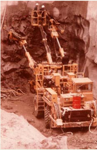
Figure 10. Drill jumbo drilling holes in face for drill and blast excavation. Temporary shotcrete is visible on the sidewalls.

significant cost savings on the project. Estimates of ground support would result from the geologic mapping and site investigation and tunnel design efforts.